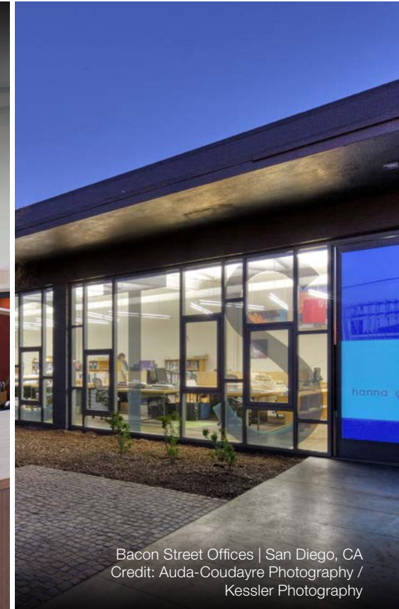
Bacon Street Offices | San Diego, CA

Many jurisdictions are advancing their energy codes to ZE or near ZE. Cities and states like the District of Columbia, New York, and California plan to issue code progressions that will continue to require energy efficiency until all new construction is required to be ZE. By committing to